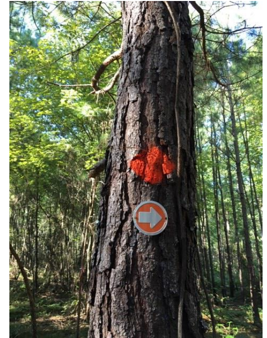
The horse trail is marked with orange arrows and/or orange diamond paint blazes.

Mason Point Horse Trail at the Jordan Game Land Old Hope Valley Farm Rd. To Transis Camp Road Chapel Hill, NC 27517