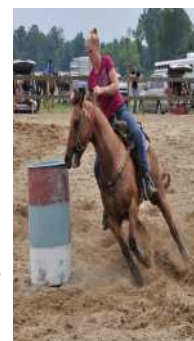
Barrel Racing joined the line up of events at the Southern Horse Festival

The proceeds from this show benefit all horsemen across North Carolina.